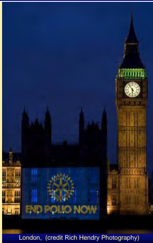
London