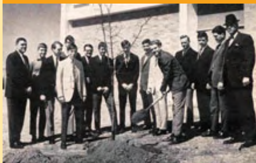
In March 1968, the Rotaract Club of University of North Carolina-Charlotte, USA, planted a tree on its campus to commemorate receiving the first Rotaract charter.

Florence, Italy; Gaston College and Sylva, both in North Carolina; and Secunderabad, India, were all certified in the following weeks. Since the 1950s, many Rotary clubs had been starting unofficial clubs for young adults, so this fueled Rotaract's rapid growth in its first few years. Rotaract grew from 21 clubs in 1967-68 to 289 clubs a year later. There are now 7,000 Rotaract clubs in 163 countries and geographic areas.