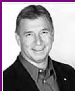
Rick Hansen, C.C., O.B.C. President and CEO, Rick Hansen Foundation